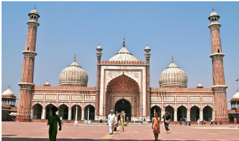
The Jama Masjid