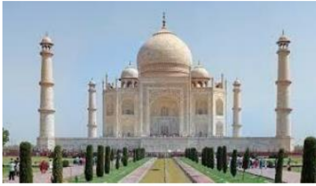
The Taj Mahal