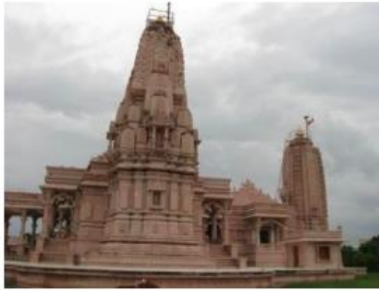
The Rajarajeshwar temple at Thanjavur