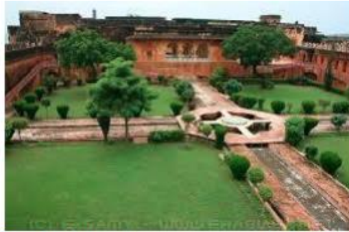
The Mughal gardens were divided into four divisions by artificial channels of water and were known as chahar baghs