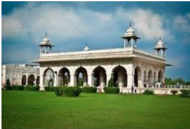
The diwan-i-khas inside the Red Fort