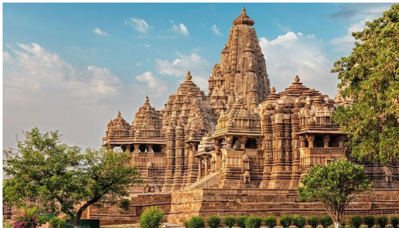
The Kandariya Mahadeva Temple at Khajuraho in Madhya Pradesh

As temples were often built by kings as a mark of their power and wealth, they were attacked by the rival invading kings.