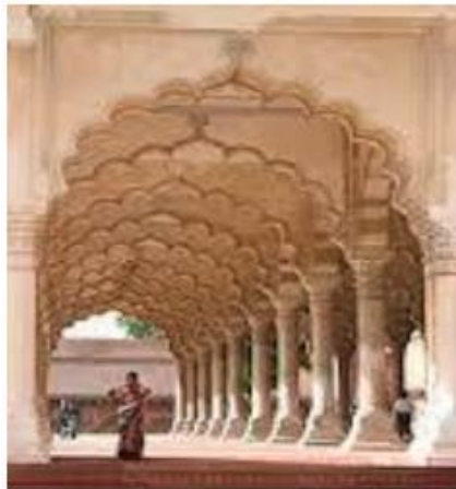
In the corbelled technique, a horizontal beam is placed across two vertical beams.

twelfth century. It created a sense of awe and respect among the people for the rulers of the Delhi Sultanate.